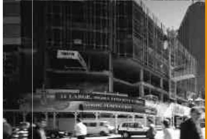
Top to bottom: Narrows Bridge , (Photo Montage) Leighton Contractors, Western Australia Balambano Dam , Thiess Contractors, Indonesia 80 Pacific Highway , Leighton Properties, New South Wales