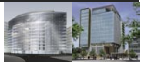
(l to r) 18 Marcus Clarke Street, Civic, ACT and Green Square, Brisbane

"The North Tower, with large typical floors of 1,850 square metres will enjoy 360 degree views to the city, Newstead and the soon to be redeveloped RNA Showgrounds. The two towers will be linked by a 2,500 square metre plaza and retail area" he said.