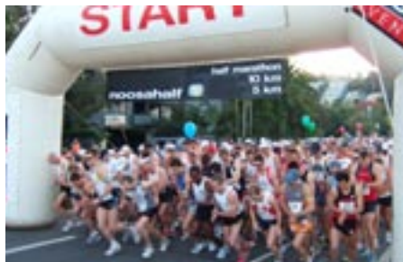
The start of the Viridian Noosa Half Marathon

"The Viridian Vertical is a great way for residents and visitors to see the whole of the 19.5 hectare, three stage, $190 million Viridian Noosa project and the harmonious blend of built form and flora