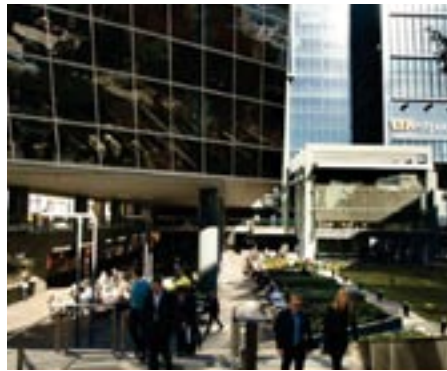
The urban park and foodcourt with main lobby in the background

In a fitting ceremony to mark the completion of this stunning project developed by Leighton Properties, the Hon John Howard MP, Prime Minister of Australia formally opened Westpac Place (previously known as the KENS Project), on 4 August 2006.