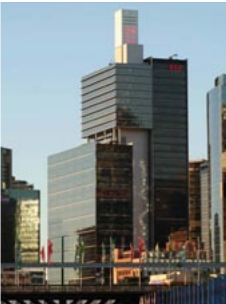
The Westpac Place architectural roof feature showing the barometric pressure at 1010 hPa

The Westpac Place architectural roof feature is now installed at Westpac Place. This feature incorporates a state-of-the-art barometer and is a key component of the overall composition of the Project. It was also a principal element of Johnson Pilton Walker's Design Excellence competition winning design for the site in 2001.