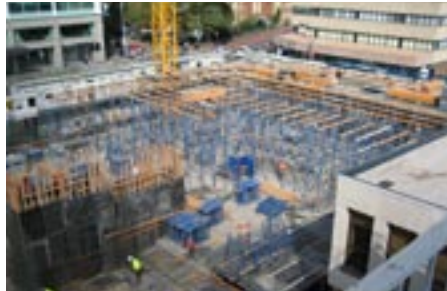
Work on the development is progressing well with excavation, piling and the basement structure completed

25 Smith Street also offers secure undercover parking for 51 cars and 40 bicycles with direct lift access from the basement to all floors.