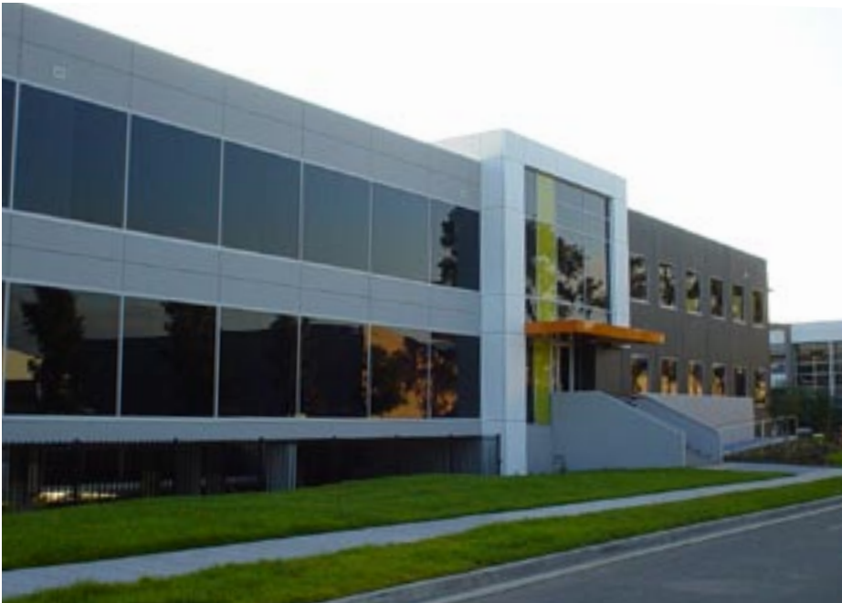
Sportscover's new corporate headquarters at ComPark, Mulgrave