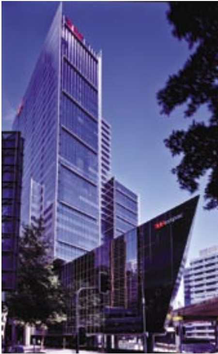
Westpac Place is a modern and striking addition to the Sydney skyline