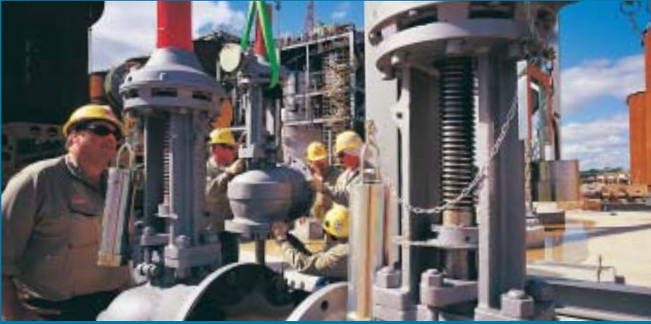
Comalco Alumina Refinery, Queensland John Holland